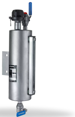
QFT6000A4M001-D0 Quench system according to API 682, 4th edition.