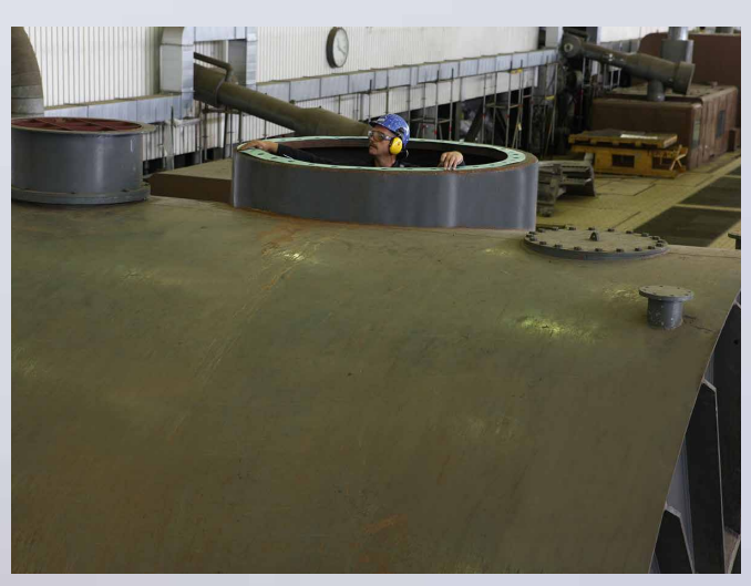
Final inspection: Burasil gasket produced by hand in the container for sealing a flange between the turbine housing and overflow pipe. The 1.6 m seal with 32 through holes (d=28 mm) in total for the bolts required considerable technical ability.