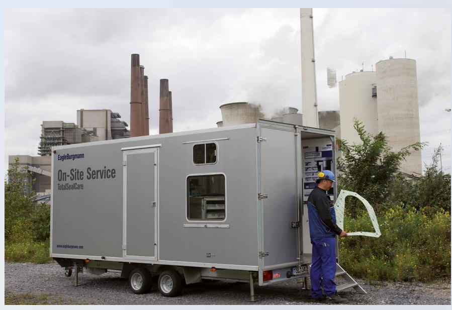
On-site seal service - mobile workshop on site at the Neurath power station

The on-site workshop, which is permanently staffed by at least one experienced service engineer, has shelves for the maintenance and overhaul items, and a mobile cutting table with sheet store. The basic equipment ranges from packing extractors,