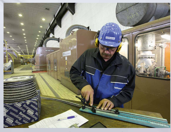
A vast range of compression packings (sizes, types of mesh, materials) are kept in stock on rolls or coils in the service container – and are cut exactly to fit on site. These packings are typically used to seal pumps and valves. They are cut with a special packing cutter (a tool from the EagleBurgmann toolbox).

If we take a look at the RWE power station in Neurath, close to the Rhineland's brown coalfield, it will show us how the mobile seal service works in practice. The coal-fired station has five blocks which were connected to the grid between 1972 and 1976. The total output is 2,200 MW. EagleBurgmann has been involved with three successive overhauls in the last two years. In late Summer 2011, the silver-grey workshop trailer with the 'On-Site Service. TotalSealCare' logo was set up for several weeks on the RWE site in the Grevenbroich district of Neurath during maintenance and overhaul of a 600 MW block.